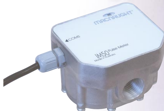
IM50 PULSE VERSION